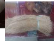
yarn separation before weaving