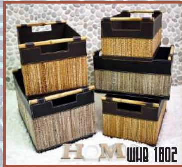
HOME WAB 1802