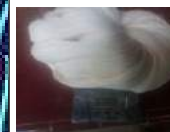
preparation of weaving yarn and natural fiber material