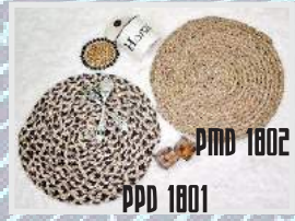
PTM 1802 PPD 1801