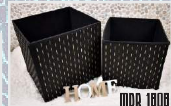
HOME MDR 1808