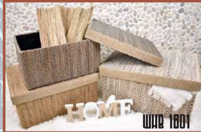
HOME WAB 1801