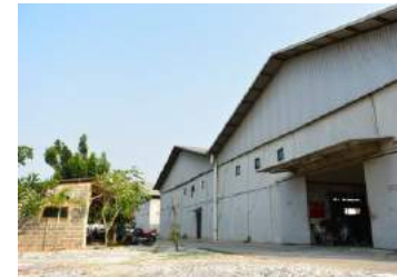
factory & warehouse