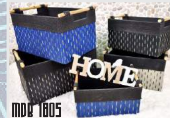
HOME MDR 1805