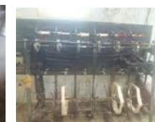
the process of yarn making to get patterned