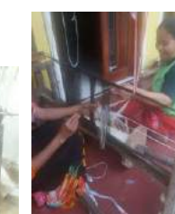
the pattern stringing