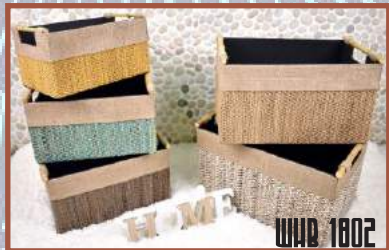
HOME WAB 1802