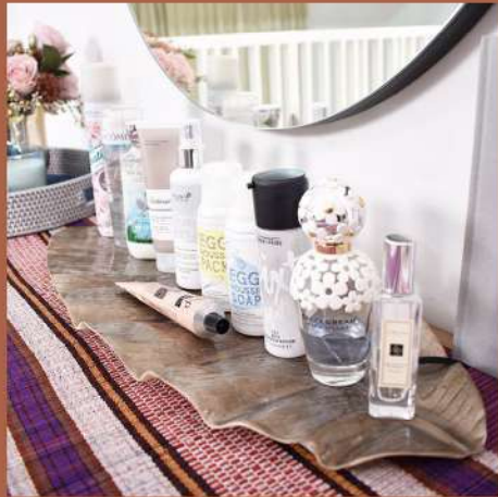
Table Runner - #32 Round Tray - #55 Decorative Capiz Tray - #81