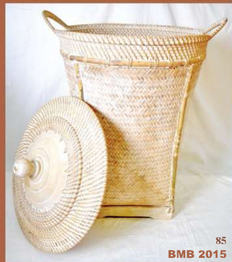
85 BMB 2015