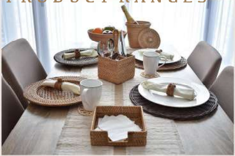
Dining & Kitchen