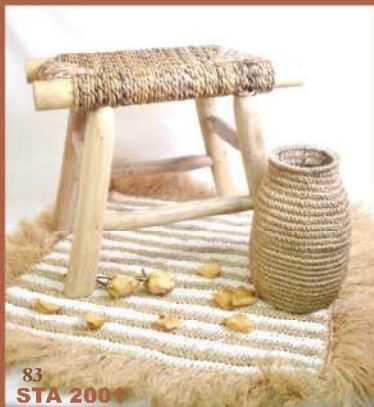
83 STA 2000