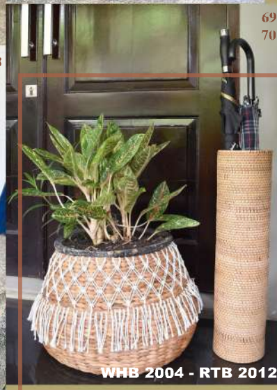
WHB 2004 - RTB 2012