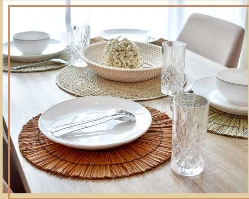
Placemat - #29, #33 Bowl - #26 Basket - #56 Rug - #97