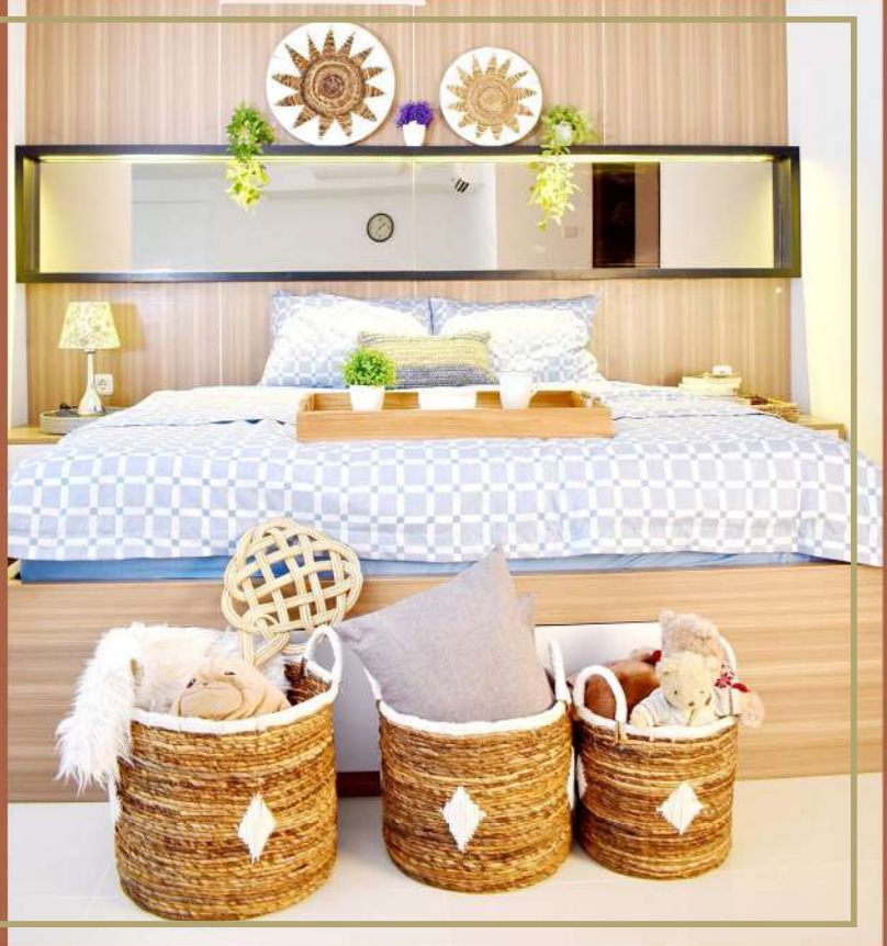
Wall Decoration - #71 Rug Shaker - #72 Tray - #73