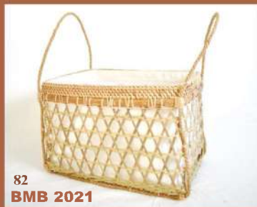
82 BMB 2021