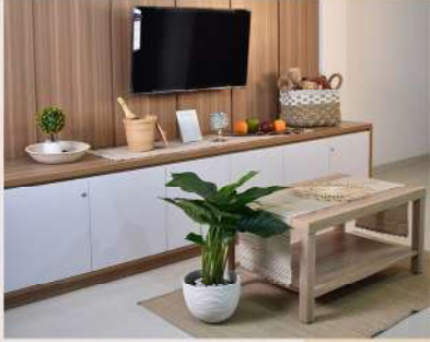
Living & Garden