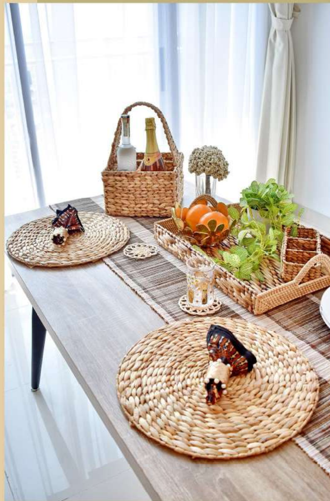
Tray - #22