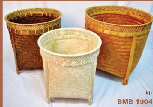
80 BMB 1904