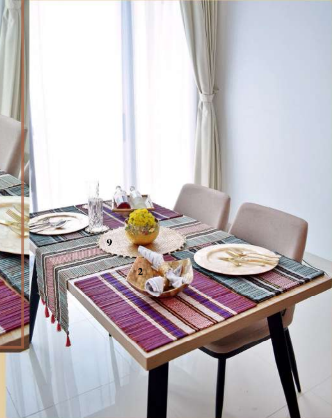
Charger Plate - #98