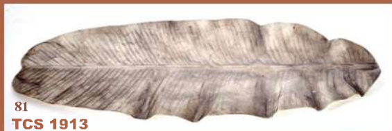
81 TCS 1913