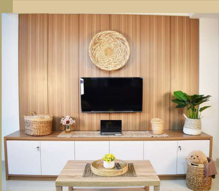
Decorative Tray - #55