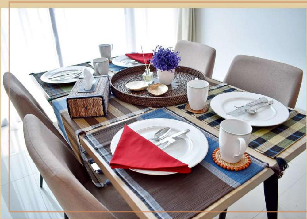
Placemats - #28, #35, #40 Tray - #37