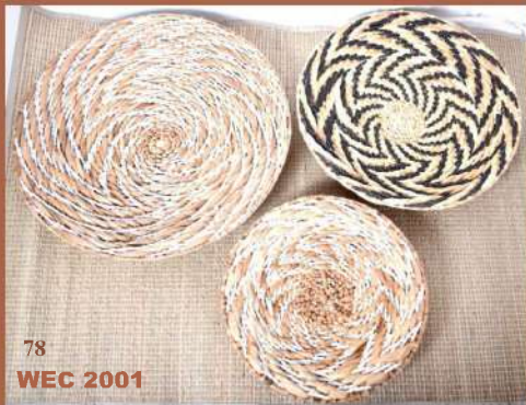
78 WEC 2001