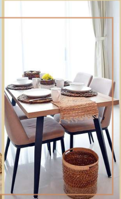
Small Basket - #45 Fruit Basket - #54 Table Runner - #14 Basket - #86 Placemats - #15, #16, #17 Decorative Placemat / Wall Deco - #89