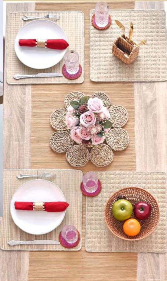
Placemat - #19 Decorative Placemat - #20 Fruit Bowl - #41 Small Basket - #90 Table Runner - #23