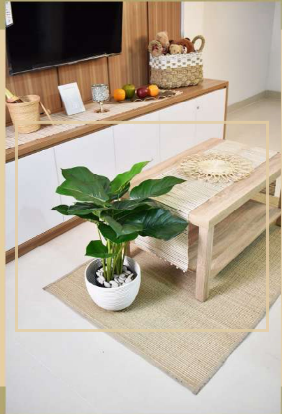
Decorative Placemat - #1, #3 White Basket - #92 Storage Basket - #88 Bowl - #26