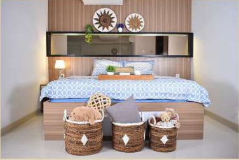
Bed & Vanity