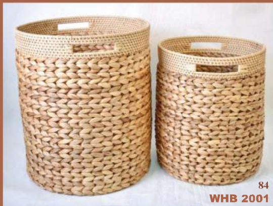
84 WHB 2001