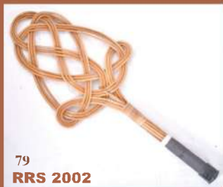
79 RRS 2002